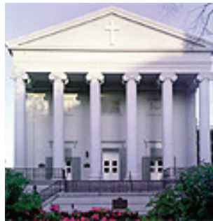
Christ Church, Savannah.

"I was from an evangelical background and held a strong "Christ Church" continued on Page 3